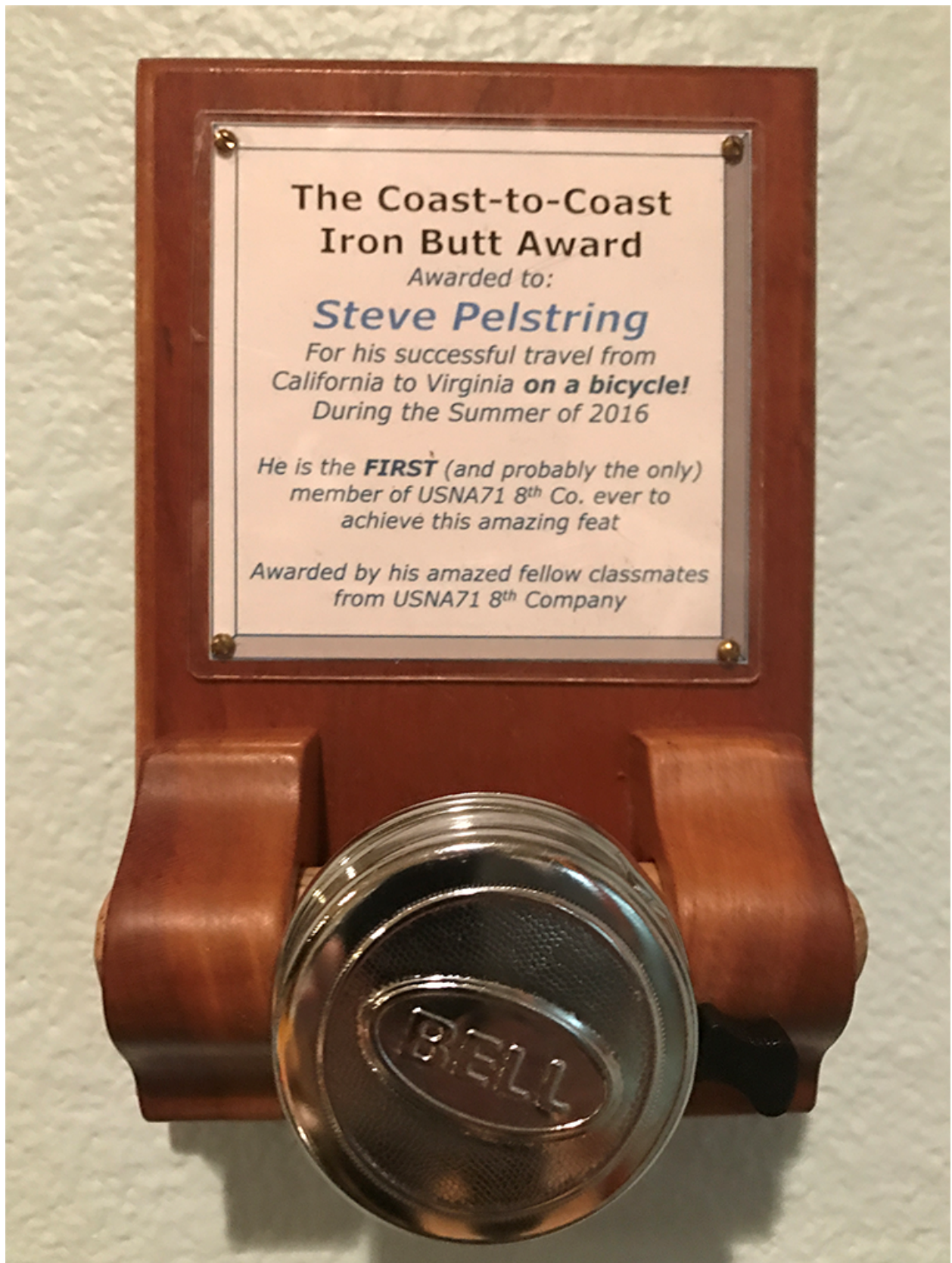
CAPTION: Iron Butt Award