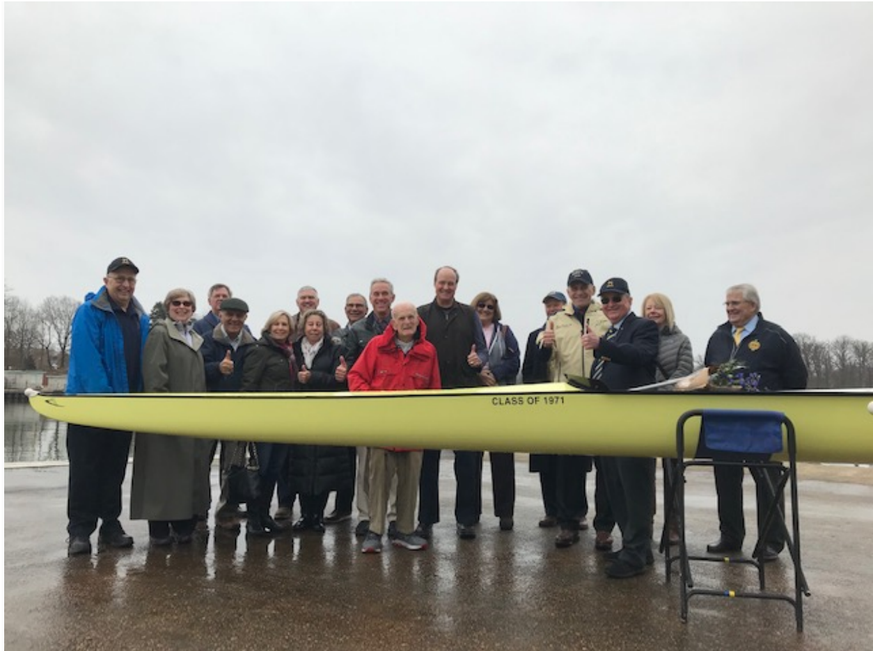
CAPTION: See names above