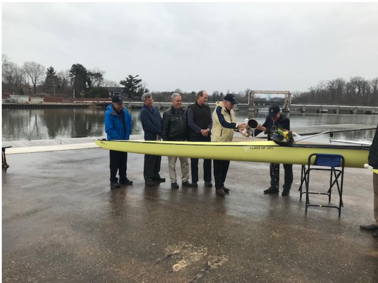
CAPTION: 71'ers christen 'Class of 1971' shell