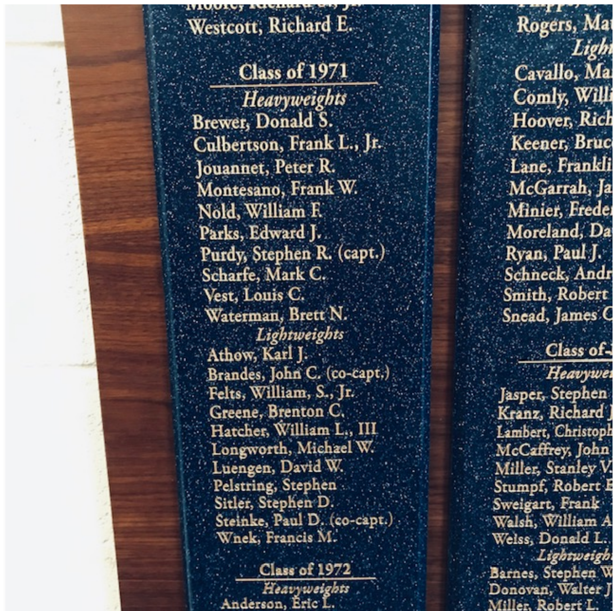
CAPTION: 71 Crew letter winners

Of particular note the Navy '71 Crew "Great 8" was the first crew since the class of '60 Olympic team to win the Eastern Sprints in 1971 - a feat that has not been matched to this day!