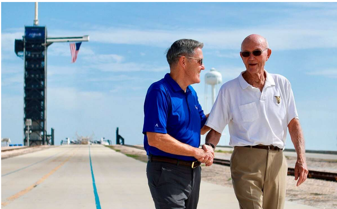
Bob Cabana with astronaut Michael Collin