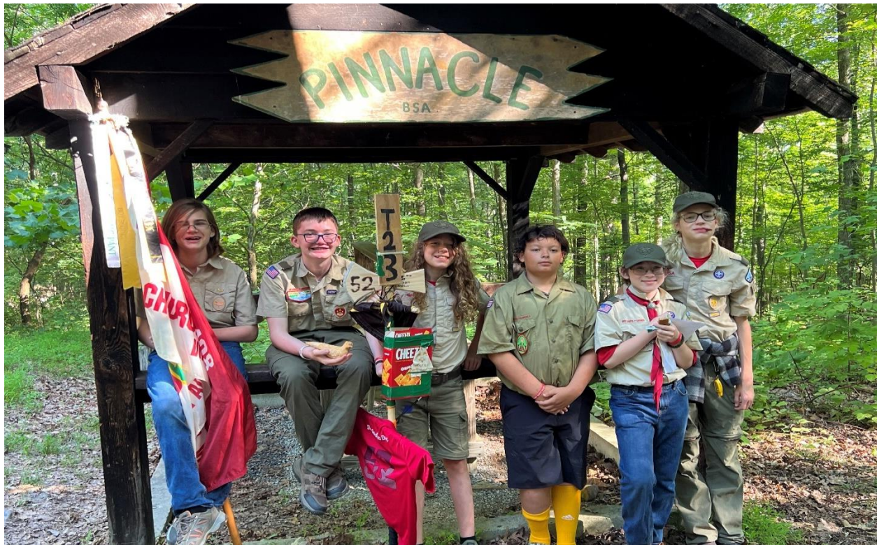
Troop 408 Scouts with the Spirit Stick

I think the boys were quite delighted when our small troop from Tidewater Council, not from Shenandoah Council, was the only Scout troop to achieve the "elite unit award." This award recognized a very active level of participation in activities other than merit badge classes. The Scouts were quite delighted when at the closing campfire Troop 408 was selected to receive the "spirit stick." The spirit stick is a clever camp device intended to generator enthusiasm. All week Troop 408 Scouts wanted to be given the spirit stick for a day. But they were given the spirit stick at the closing ceremony, so they have it for the full year. Below is a photo of the troop with the stick. You can see their smiling happy faces. This is quite a pleasure to work with these Scouts to help them develop to become productive citizens of our great nation