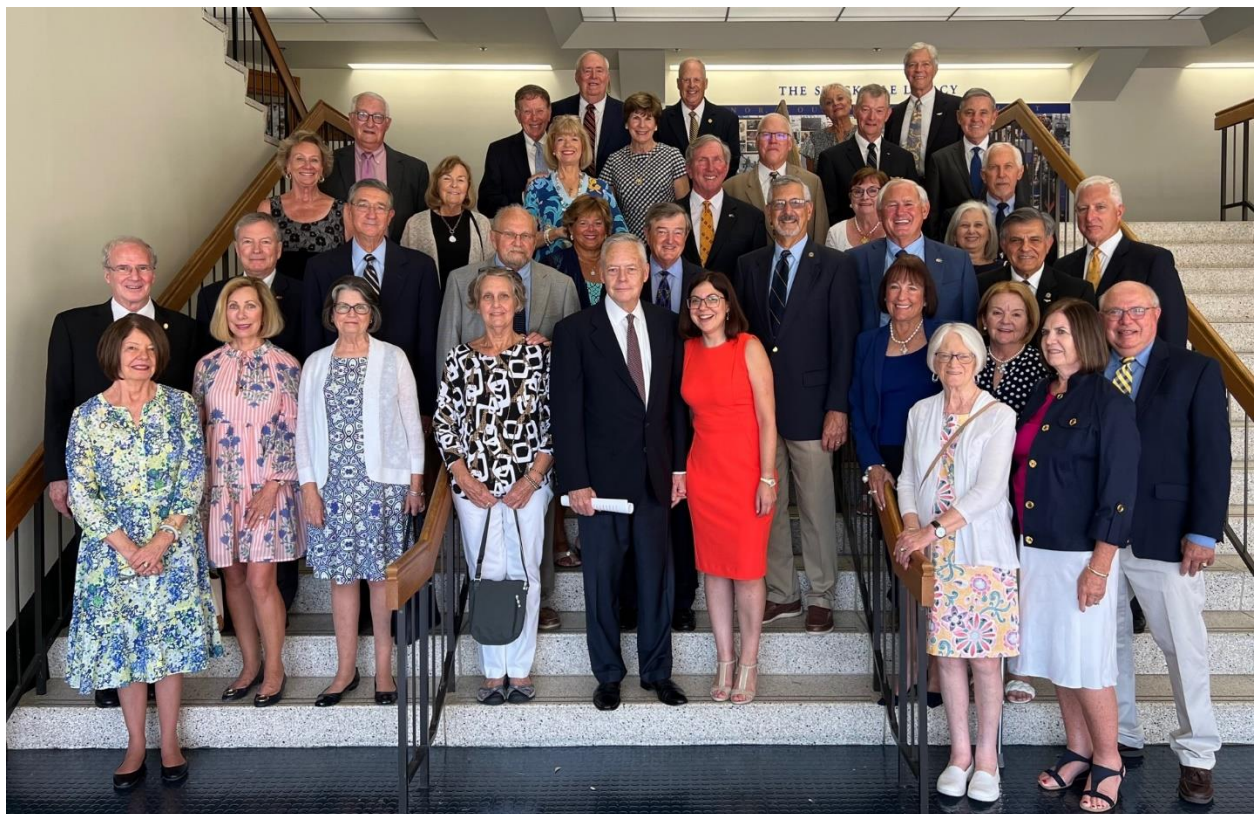
'71's newest DGA with classmates at DGA ceremony