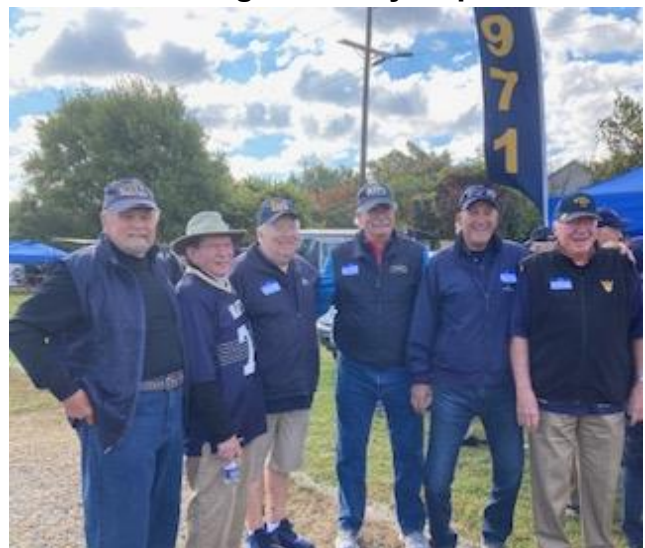
NAPS '67 at Air Force-Navy