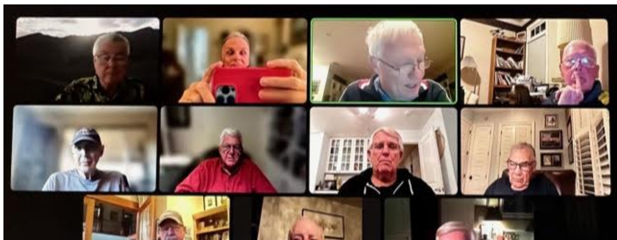
26th Company Zooming!