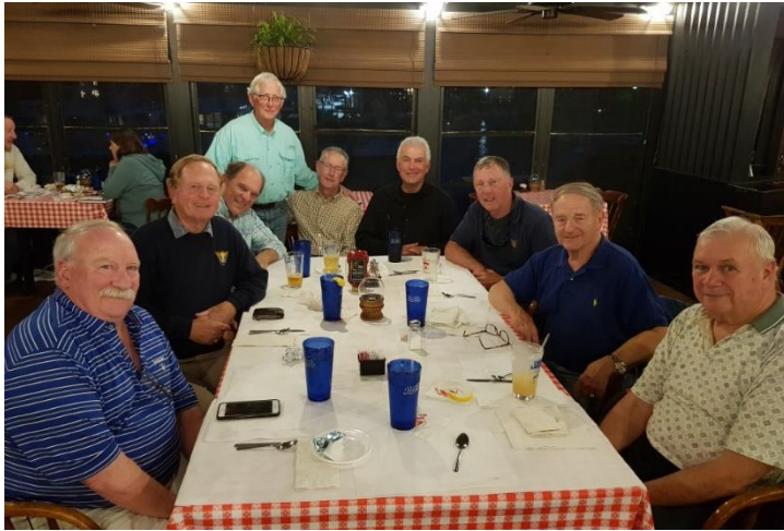
36th CO enjoying a festive dinner at the Crab Claw

The Dark Ages are here again! The Army-Navy game 2023 is in the history books, and I am hopeful NAVY WINS! But, two weeks prior to the game it is anyone's guess regarding the outcome. Army has done well again this year, but we know that is not the determining factor. Navy Football has steadily improved with its formidable defense and a maturing offense! I will have a report in the March column written while in Boston! GO NAVY!