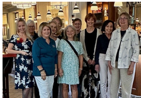
Club34 Reunion GALS