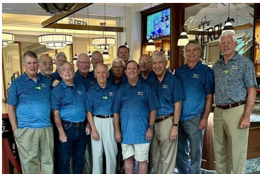
Club34 Reunion Guys

“The photos below were at Kilroy’s, Higgins Hotel; catching Navy-UAB game before dinner.